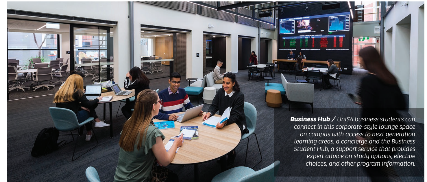
Business Hub / UniSA business students can connect in this corporate-style lounge space on campus with access to next generation learning areas, a concierge and the Business Student Hub, a support service that provides expert advice on study options, elective choices, and other program information.