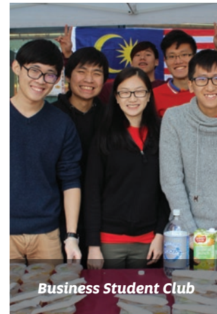
Business Student Club