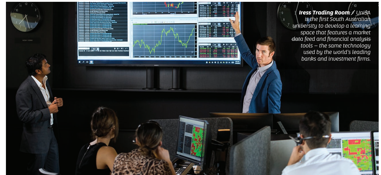
Iress Trading Room / UniSA is the first South Australian university to develop a learning space that features a market data feed and financial analysis tools – the same technology used by the world's leading banks and investment firms.