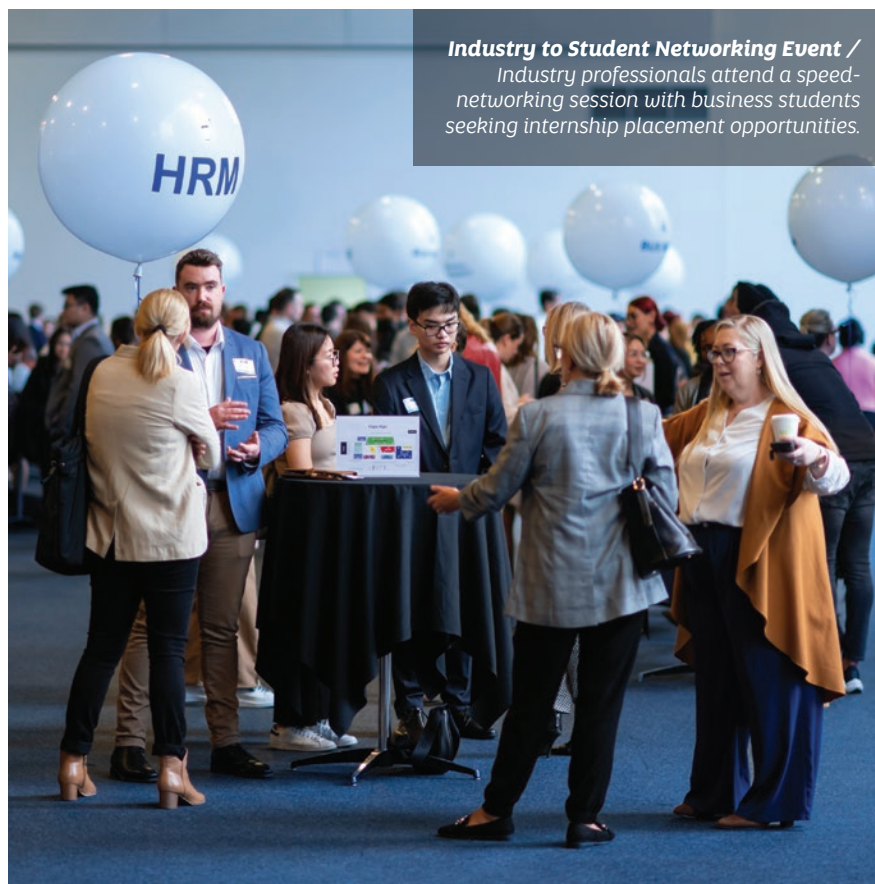
Industry to Student Networking Event / Industry professionals attend a speed-networking session with business students seeking internship placement opportunities.