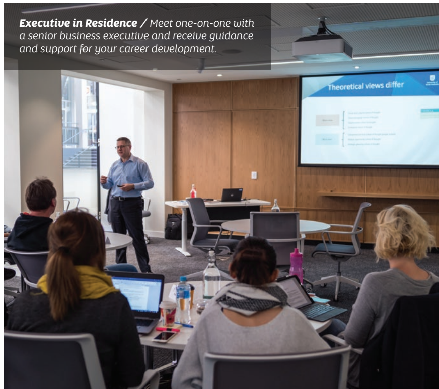
Executive in Residence / Meet one-on-one with a senior business executive and receive guidance and support for your career development.

Connect with our expert career advisers for advice, gain access to networking opportunities, industry events and an Online Career Hub with job resources and listings.