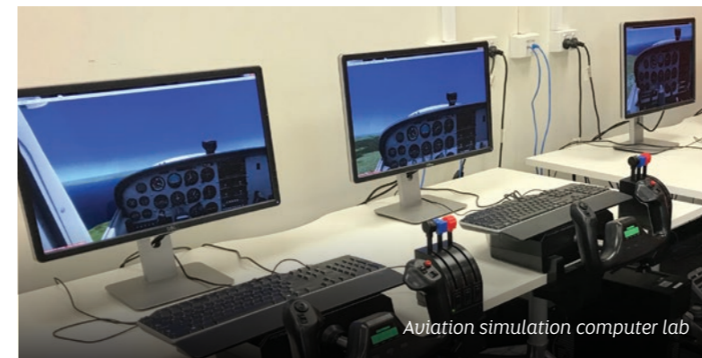
Aviation simulation computer lab

Final year project Present aviation research to industry