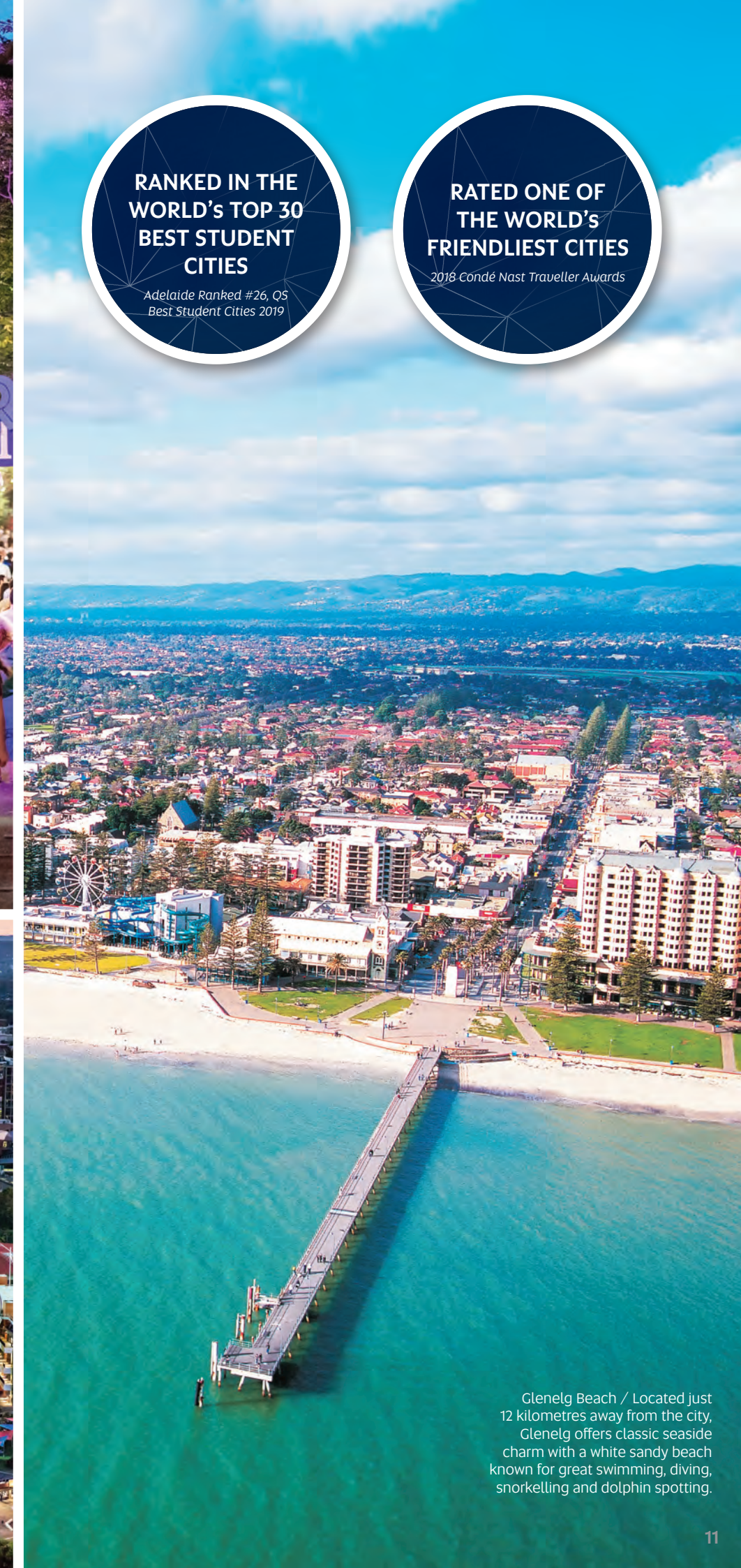
Glenelg Beach / Located just 12 kilometres away from the city, Glenelg offers classic seaside charm with a white sandy beach known for great swimming, diving, snorkelling and dolphin spotting.