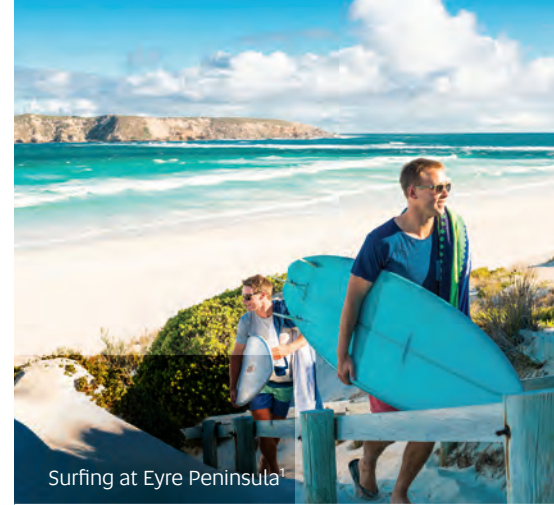
Surfing at Eyre Peninsula 1