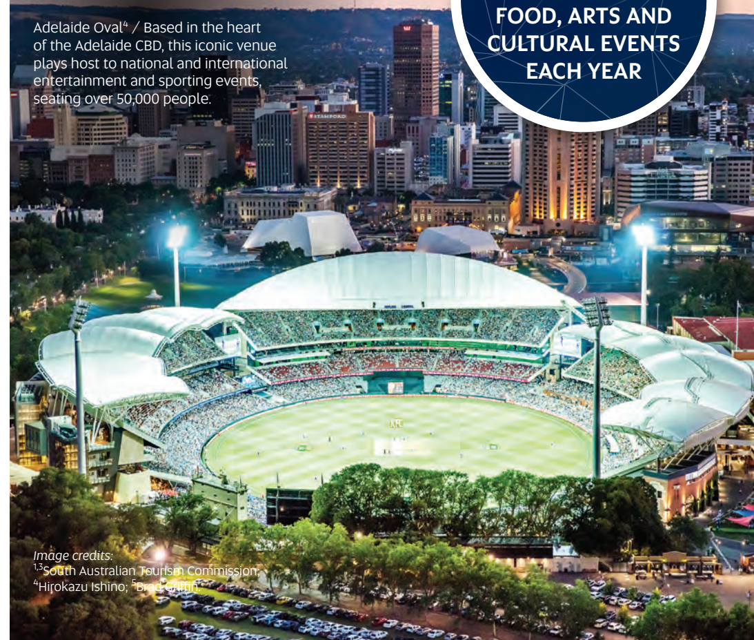
Adelaide Oval 4 / Based in the heart of the Adelaide CBD, this iconic venue plays host to national and international entertainment and sporting events, seating over 50,000 people.

South Australia is host to more than 400 SPORTING, FOOD, ARTS AND CULTURAL EVENTS EACH YEAR