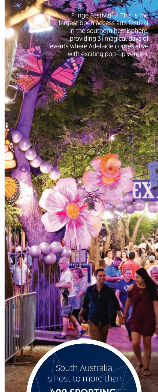
Fringe Festival 3 / This is the largest open access arts festival in the southern hemisphere, providing 31 magical days of events where Adelaide comes alive with exciting pop-up venues.

South Australia is host to more than 400 SPORTING, FOOD, ARTS AND CULTURAL EVENTS EACH YEAR