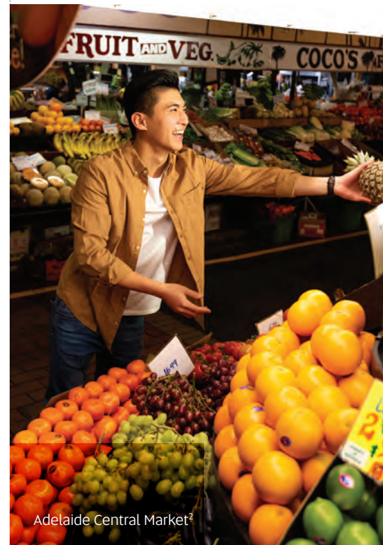
Adelaide Central Market 2