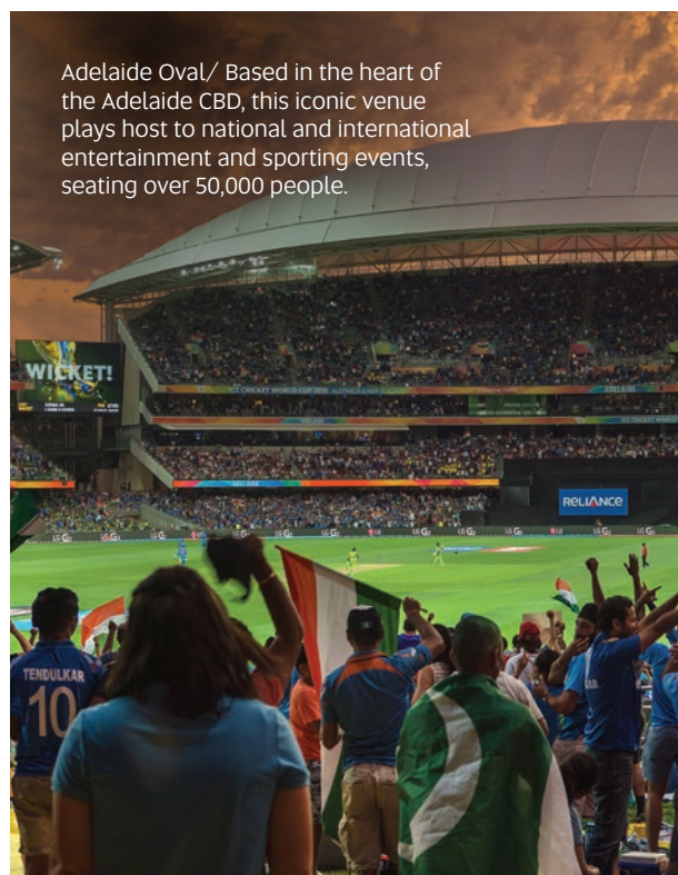
Adelaide Oval/ Based in the heart of the Adelaide CBD, this iconic venue plays host to national and international entertainment and sporting events, seating over 50,000 people.