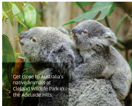
Get close to Australia's native animals at Cleland Wildlife Park in the Adelaide Hills.