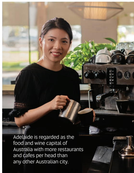
Adelaide is regarded as the food and wine capital of Australia with more restaurants and cafes per head than any other Australian city.